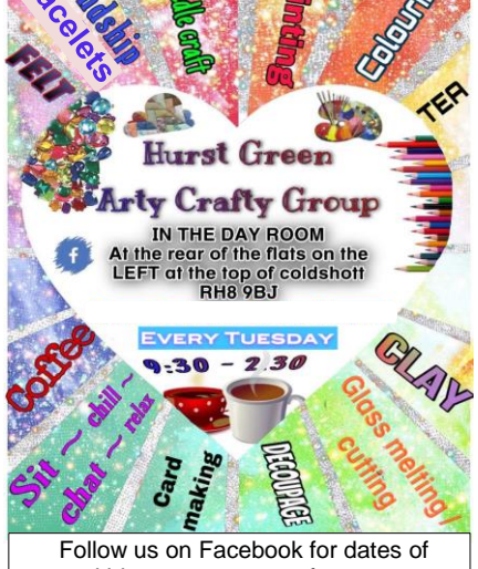
kids groups: arty crafty group